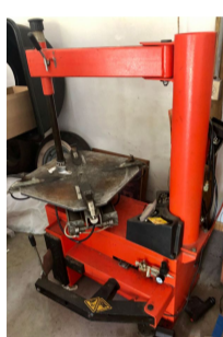
Tire mount machine