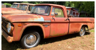
1 of sev. 1960's Dodge pick-ups