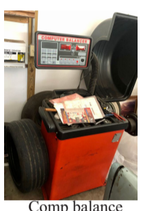
Comp balance machine