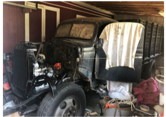
1939 Dodge grain side, partially restored