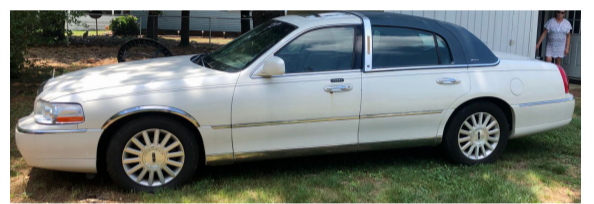
2004 Lincoln Town Car, loaded w/leather