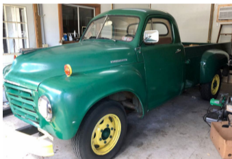
1949 running Studebaker pick-up