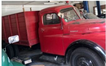
1 of 2 1948 Dodge grain trucks, runs