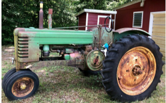
Late 1940's John Deere B styled tractor