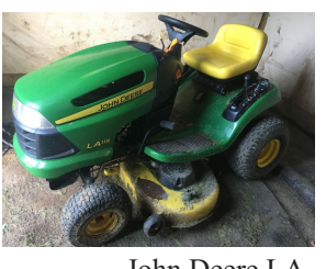
John Deere LA 15 garden tractor w/belly mower